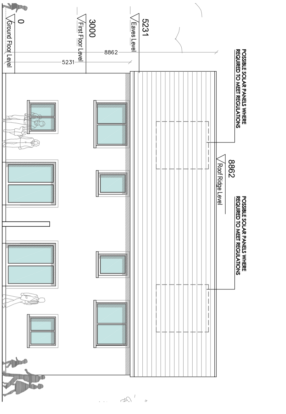
Proposed 3B Rear Elevation SCALE 1:100 @ A3