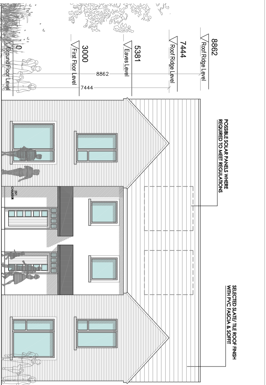
Proposed 3B Front Elevation SCALE 1:100 @ A3