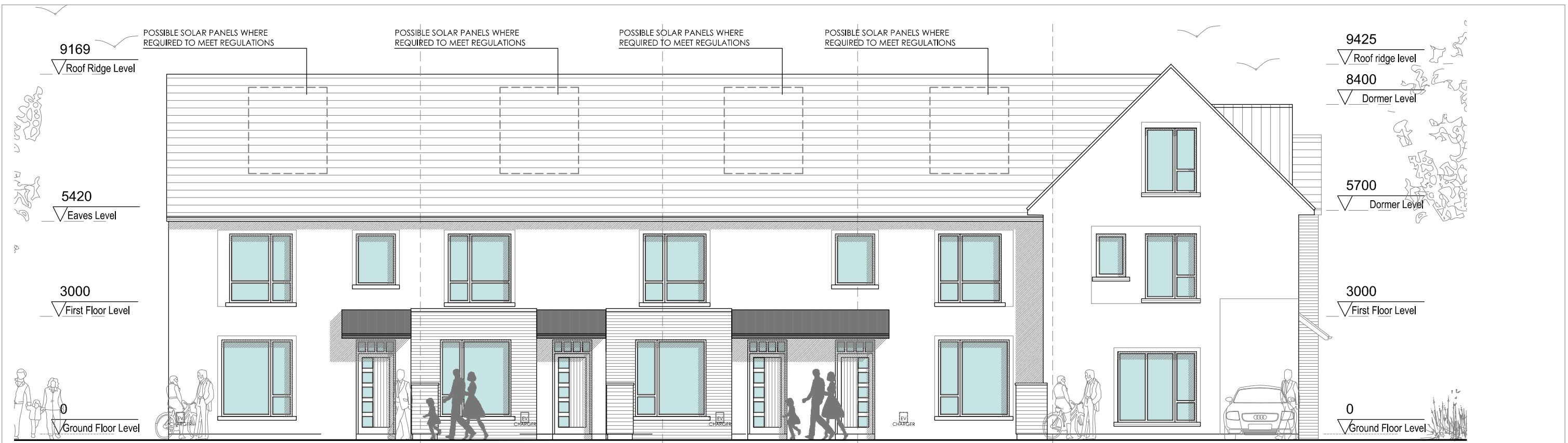
HOUSE TYPE 7B 3 BED LEFT END TERRACE HOUSE TYPE 6 2 BED MID TERRACE HOUSE TYPE 6 2 BED MID TERRACE HOUSE TYPE 7A 3 BED MID TERRACE HOUSE TYPE 10 4 BED RIGHT END TERRACE