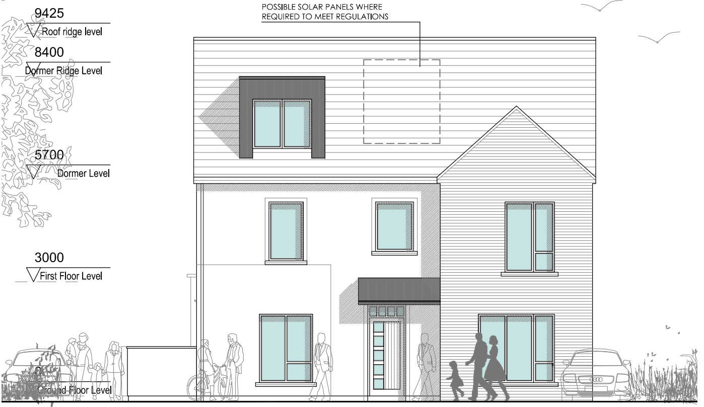
HOUSE TYPE 10 4 BED RIGHT END TERRACE