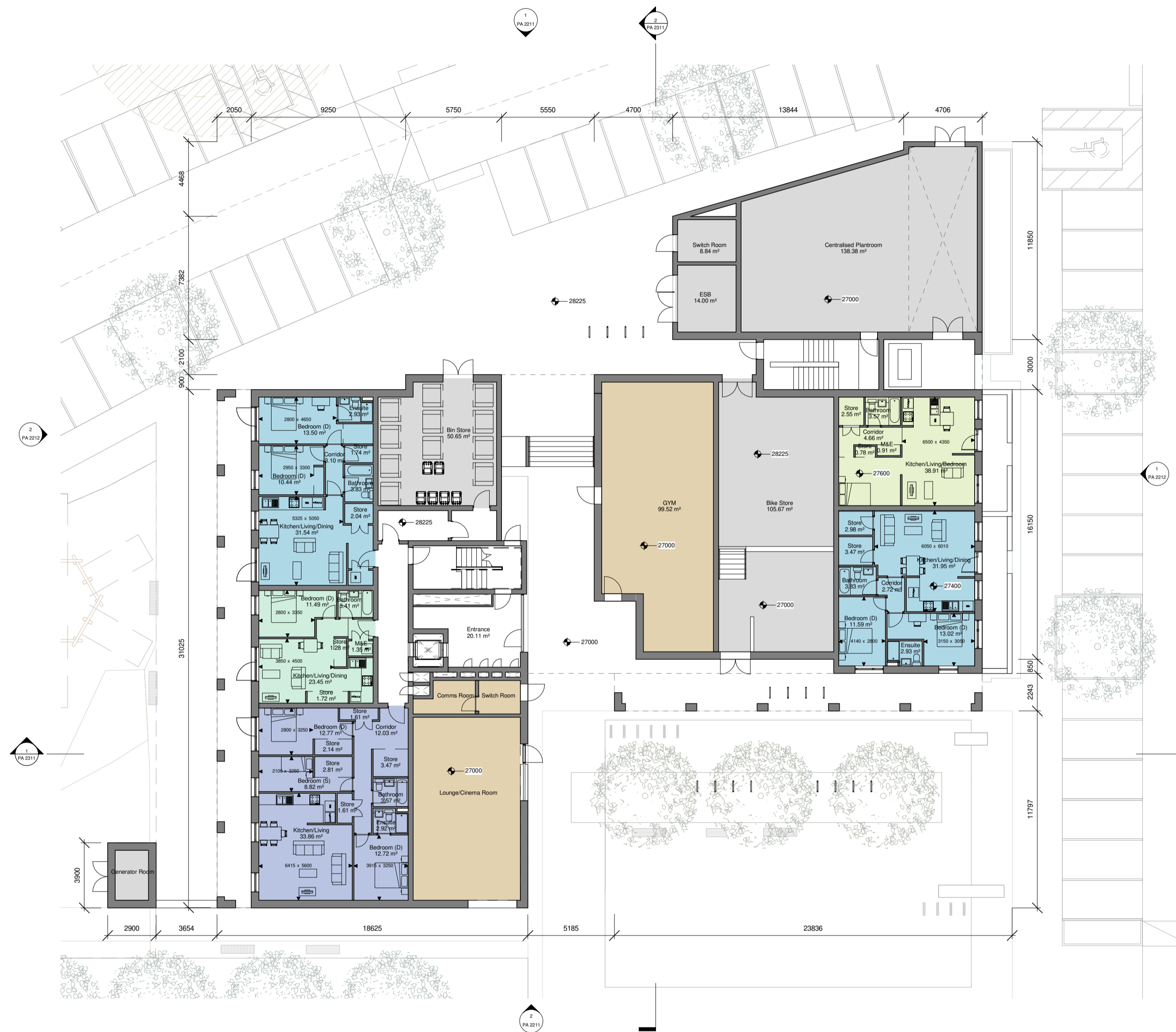
1 Block A - Level 00 1 : 200