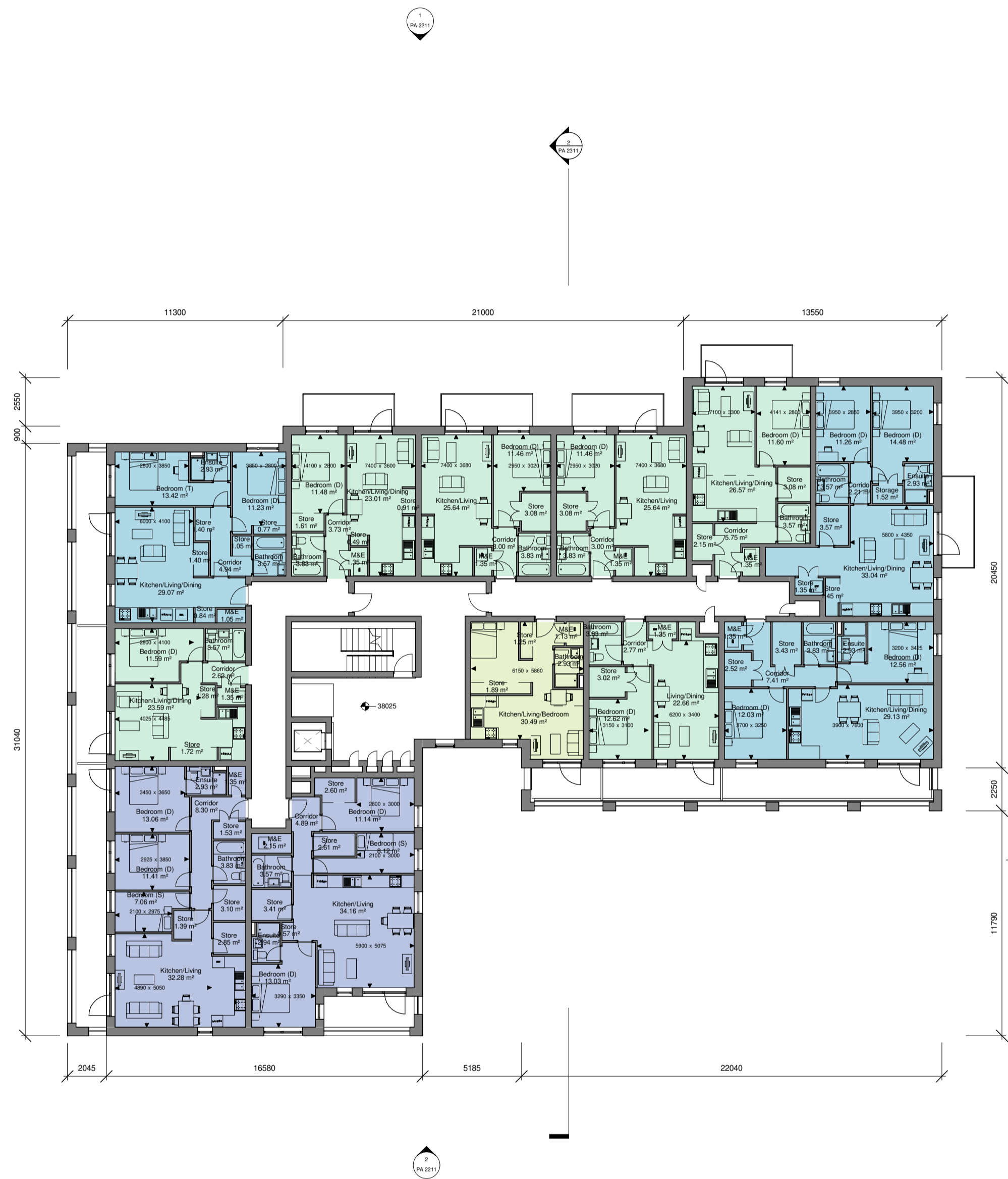
1 Block A - Level 03 1 : 200