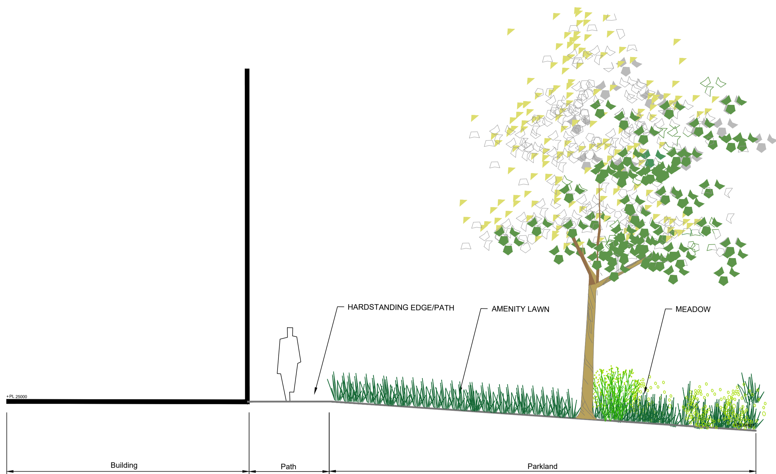
04 PARKLAND INTERFACE D-D SCALE: 1:50