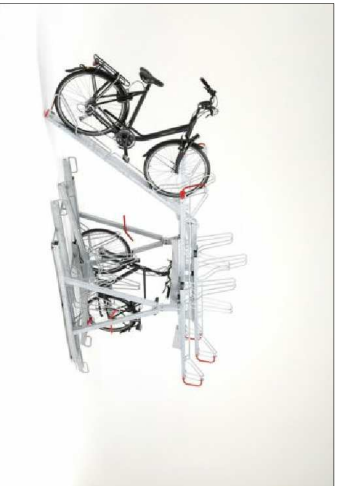
01 Bicycle Unloading nts