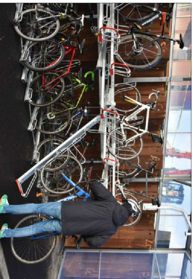
01 User Operation nts