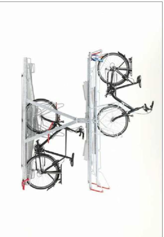
01 Bicycle loaded nts

The copyright of this drawing is vested with Corstorphine & Wright Ltd and must not be copied or reproduced without the consent of the company. Figured dimensions only to be taken from this drawing. DO NOT SCALE. All contractors must visit the site and be responsible for checking all setting out dimensions and notifying the architect of any discrepancies prior to any manufacture or construction work.