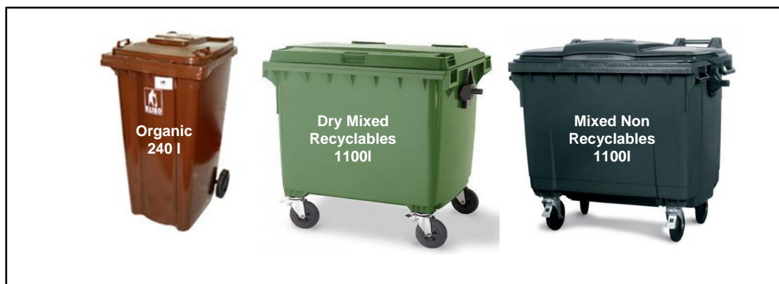
Figure 5.1 Typical waste receptacles of varying size (240L and 1100L)

The types of bins used will vary in size, design and colour dependent on the appointed waste contractor. However, examples of typical receptacles to be provided in the WSA are shown in Figure 5.1. All waste receptacles used will comply with the IS EN 840 2012 standard for performance requirements of mobile waste containers, where appropriate.