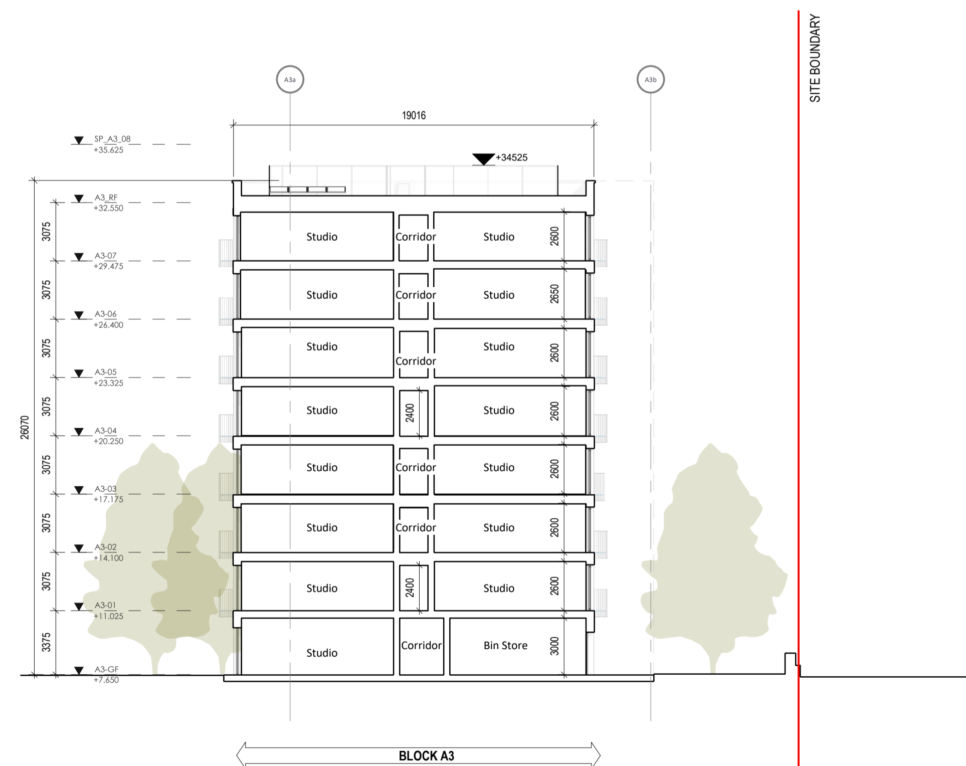
3 A3-Section A-A 1 : 200